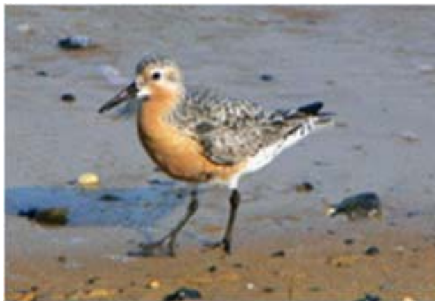
Red Knot at Delaware Bay